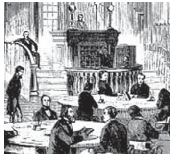
1857 Dred Scott case